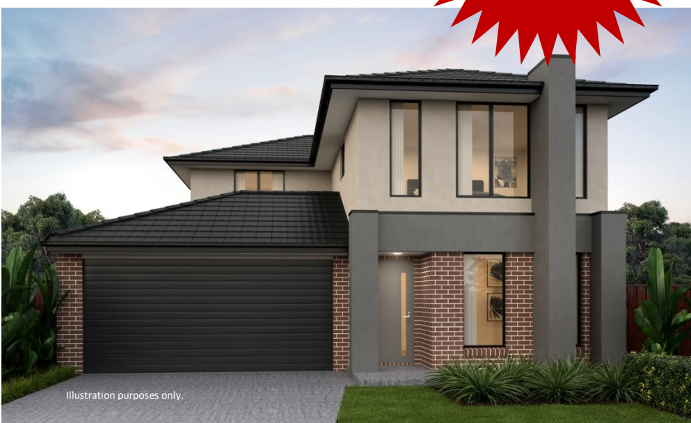
Illustration purposes only.