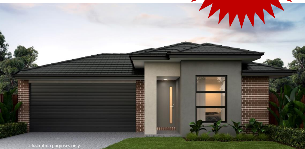
Illustration purposes only.